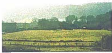
Early morning mist over Langsett village

1 This section of the walk starts at Cote Green, Finkle Street Lane. In 2003 a car park will be opened which will serve the various recreational routes that converge at the former Wortley Station.