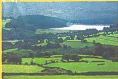
Langsett Reservoir from Hartcliffe Hill

Westwards we leave the apparent influence of the steel industry behind to enter the Peak District, the first National Park, designated in 1951. The Park provides protection for this unspoilt and often wild countryside and opportunities for visitors to enjoy.