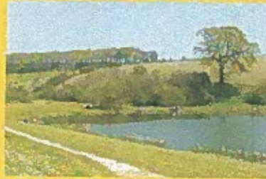
'The Dell' Nature Reserve, Brierley

Again in contrast, the former mining villages of Thurnscoe, Goldthorpe and Bolton upon Dearne are engaged in the revitalisation which extends across the Dearne Valley.