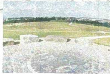
Phoenix Park, Thurnscoe

14 At Barnburgh Lane turn left, then right into Engine Lane, then bear right along a sometimes indistinct footpath heading for Bolton Church. Skirt the edge of the Recreation Ground and fishing ponds following the lane to Bolton upon Dearne Railway Station.