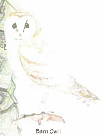
Barn Owl I