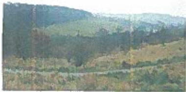
Tom Bank Wood

9 The path bears left and left again across a wooden footbridge. 600 yds further on cross a bridge over the railway line and head to Chapel Lane, north of Thurnscoe East.