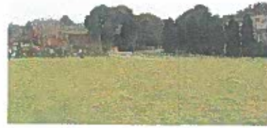
Home Farm, Cannon Hall Country Park

2 After passing through Upper Denby village turn right immediately after the railway bridge and ascend the stone steps. Follow the path and lane towards Gunthwaite Hall.