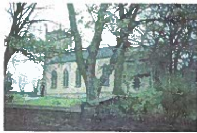
St. John's Church, Upper Denby